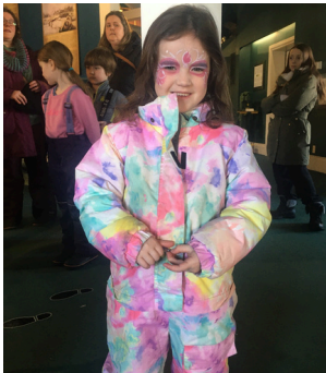
Family Day Activities