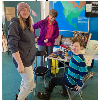
Family Day Crafts