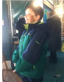
Family Day Activities