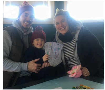
Family Day Crafts