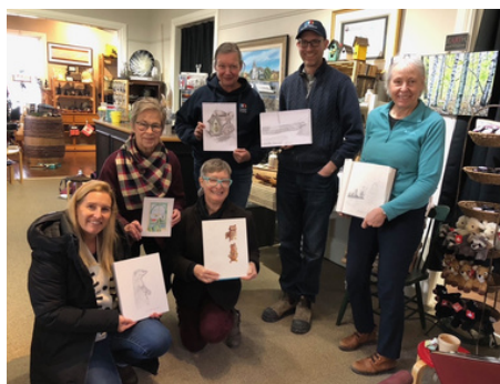
The 1000IHM Staff and Volunteers Hard at Work!