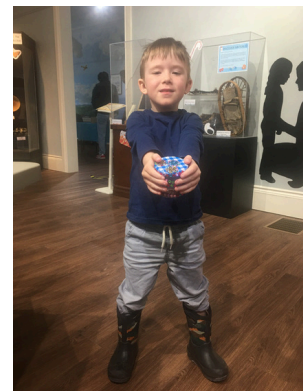
Enjoying the 1000IHM March of the Museums programs and performances!