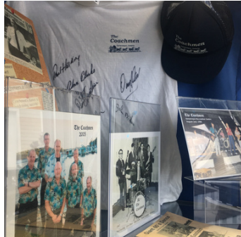
Remember The Music Display