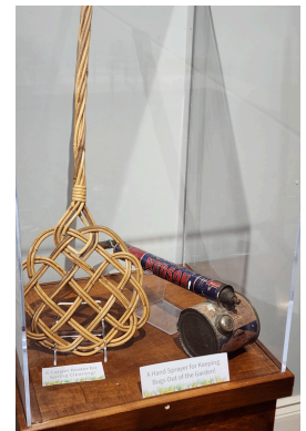
The wonderful artifacts of the Town of Gananoque Civic Collection